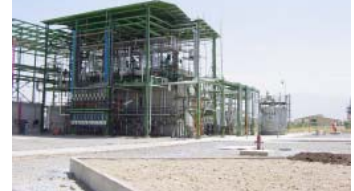
Turkey - Sabic Plant - 400,000 t/y