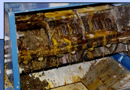
Mini Press operating on Cold Whole Rape Seed